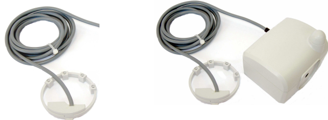
With ARROW (Remote Reading System)